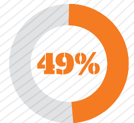
are heavy users of collaboration tools